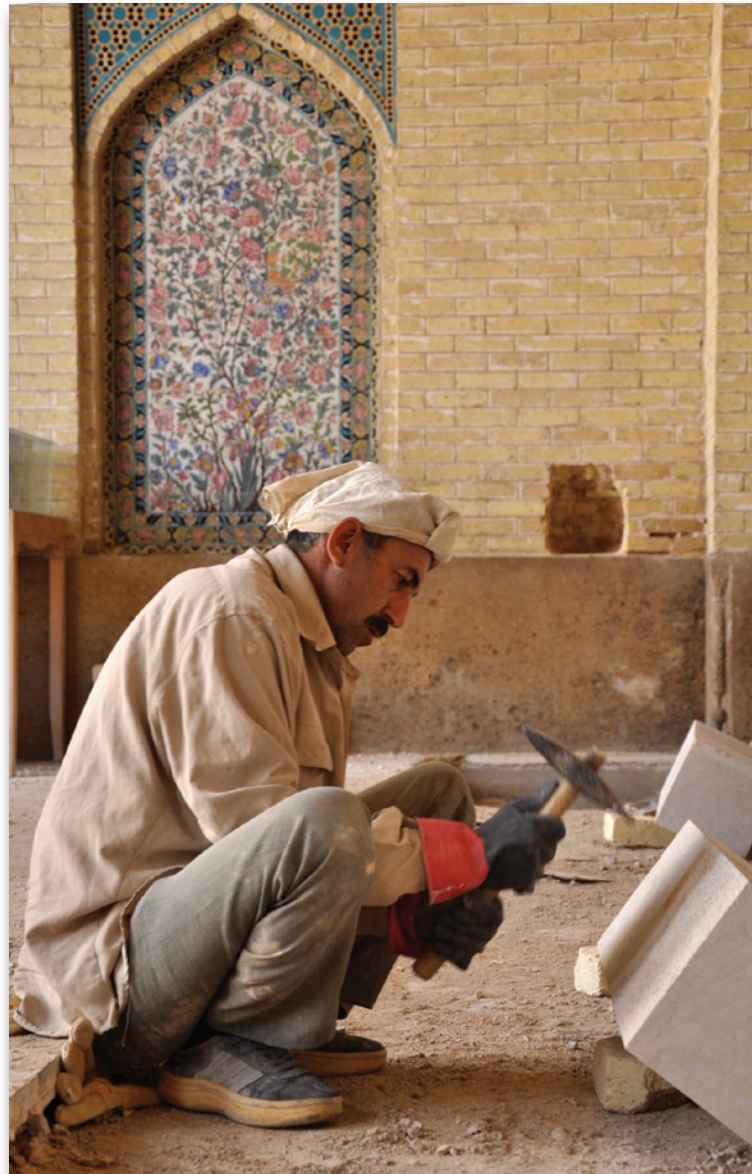
A mason at work carving stone. These workers are at risk of inhalational lung disease. For an article on inhalational lung disease see The International Journal of Occupational and Environmental Medicine 2010;1:29-38 (Available from www.theijoem.com/ijoem/index.php/ijoem/article/view/4 )