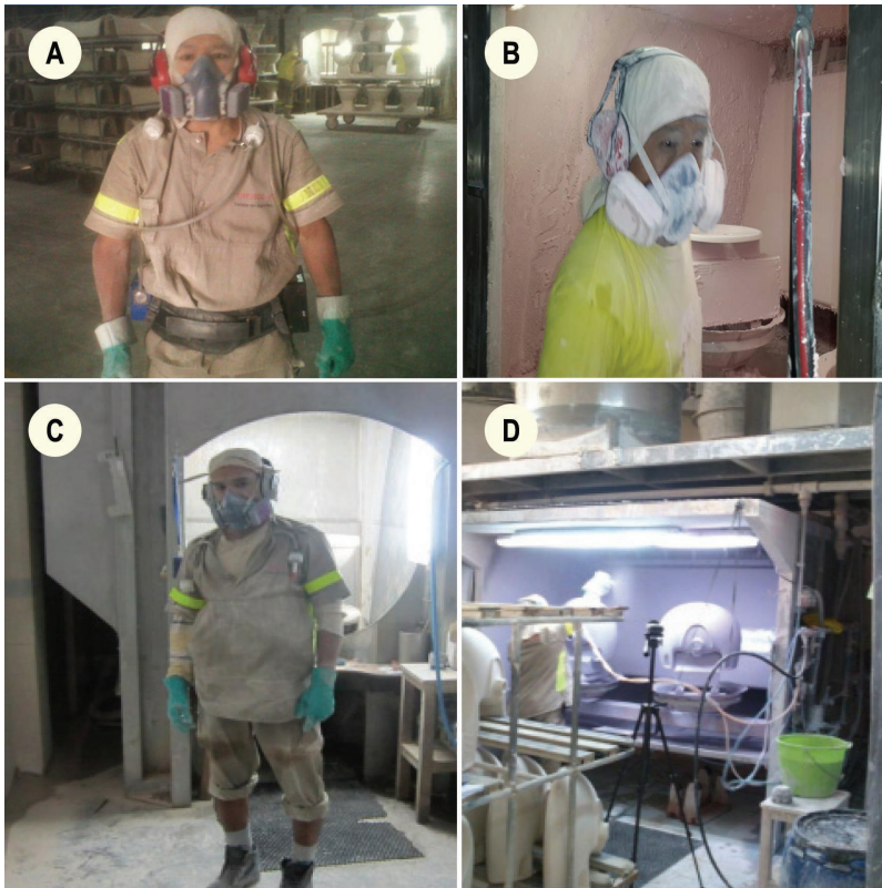
Figure 1: A typical personnel during the execution and at the end of his work activities. A) A polisher with particulate matter sampling pump whose eyebrows become white by the dust generated by the polishing of the toilets. B) An enameller whose eyebrows and the ocular perimeter become white by the particulate matter. C) A polisher with particulate matter sampling pump. The polishing booth is seen behind the employee. D) An enameller doing the lavatories enamelling process. The enamelling cabin and the mist generated are observed.

In mild and non-inflamed cases, the pterygium is usually asymptomatic. 19-22 However, in advanced or recurrent forms, elevated areas can cause symptomatic epithelial keratopathy producing tearing reflex, photophobia and foreign body sensation. 2,3,23,24 If it grows, it can reduce the visual capacity, causing irregular astigmatism. 2,22,24